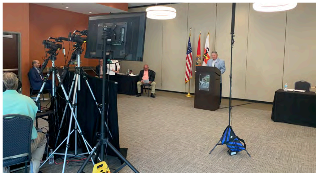
Behind the scene at the 2020 virtual Annual Meeting