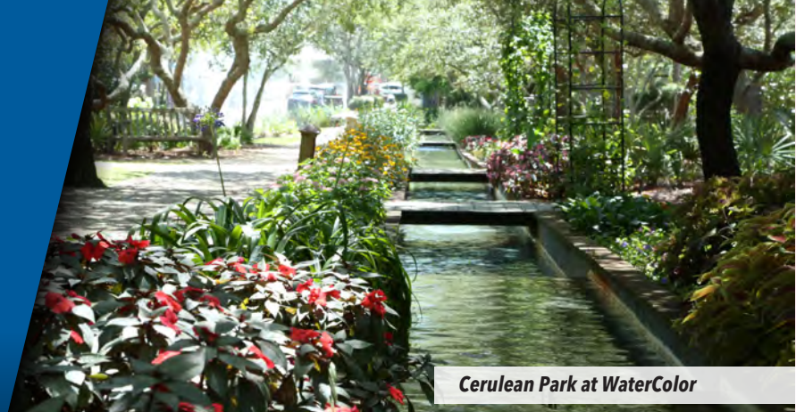
Cerulean Park at WaterColor