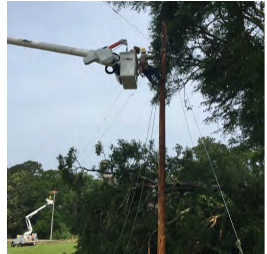
CHELCO Linemen helping Covington Electric Cooperative restore power

Restoration efforts were completed by April 23 to all homes that could receive power.